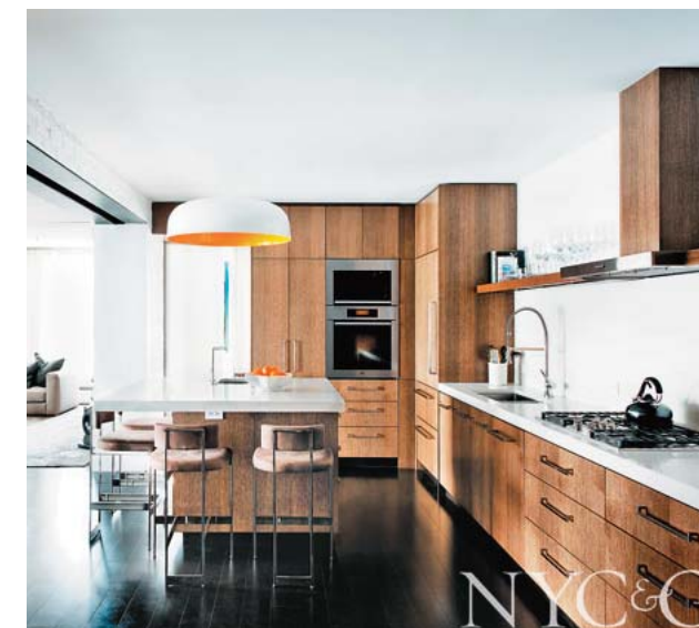
2014 Innovation in Design Awards Winner: Kitchen Design

FINALIST: DHD Architecture & Interior Design