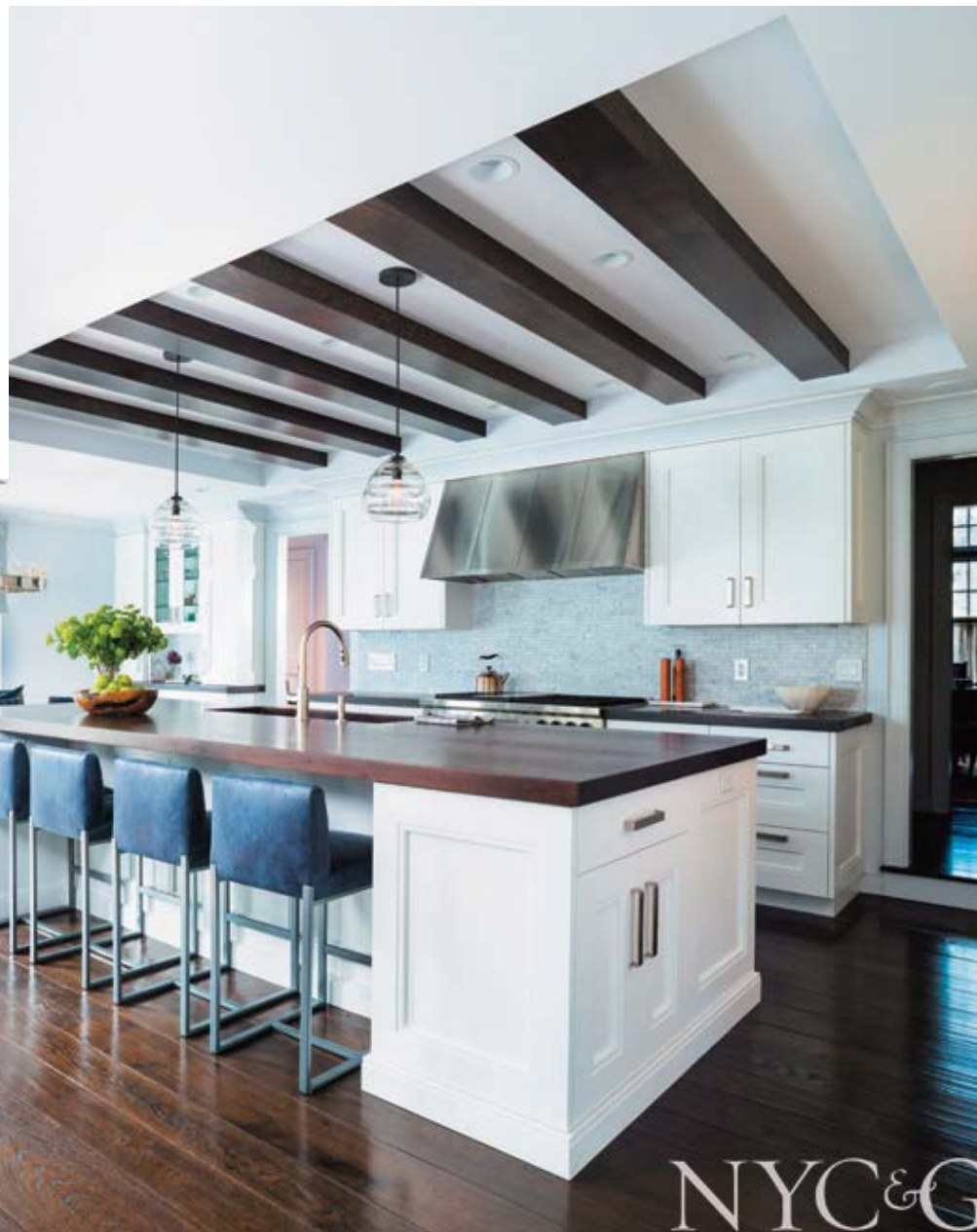
2014 Innovation in Design Awards Winner: Kitchen Design RUNNER-UP: Deane, Inc.

Sometimes the most practical element in a kitchen is also the most dramatic and daring. For this project, Deane installed a stainless-steel hood with so much reflective quality that the surface captures the dark wood tones of the ceiling beams. As judge Kerry Delrose says, "It's the wow factor!" There are other surprises, too, including an expansive white island topped with two-inch-thick walnut counters, blue leather stools, a marble backsplash, and sculptural handblown glass pendants. The once choppy, multi-level area is now a single-level space that melds beautifully with an adjacent family room. "This is a great open plan for family living," comments judge Bunny Williams, "with warm details throughout."